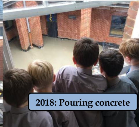
2018: Pouring concrete