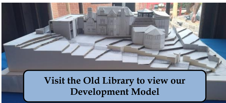
Visit the Old Library to view our Development Model